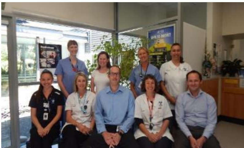
The Radiology Co-Design Project Team!

As the NRSII project was in progress, we managed to get representation from the service manager, radiologist, medical radiation technologist (MRT), nursing and administration areas who were based at the Nelson hospital site.