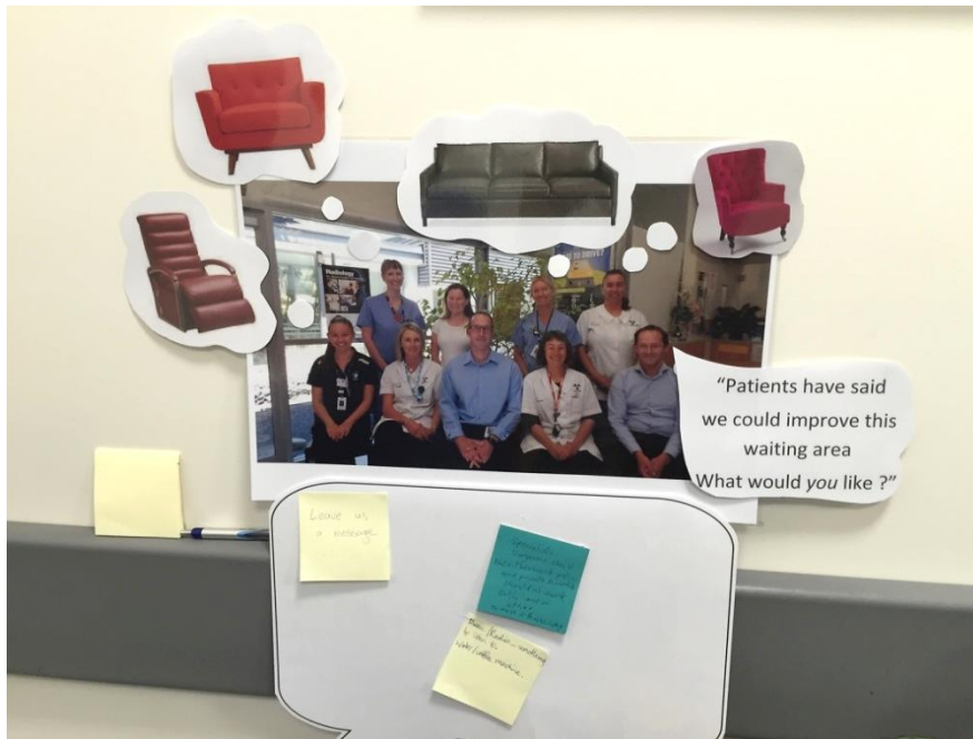
Post-it notes: Themes explored!

Any changes to furniture will be dependent upon funding and approval. We are investigating charitable funding sources.