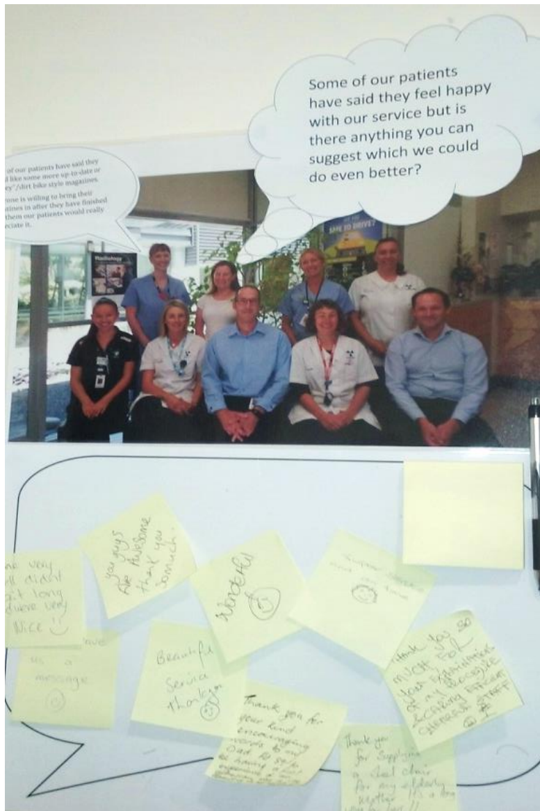
Team Poster in the waiting area gets lots of feedback ...mostly positive!