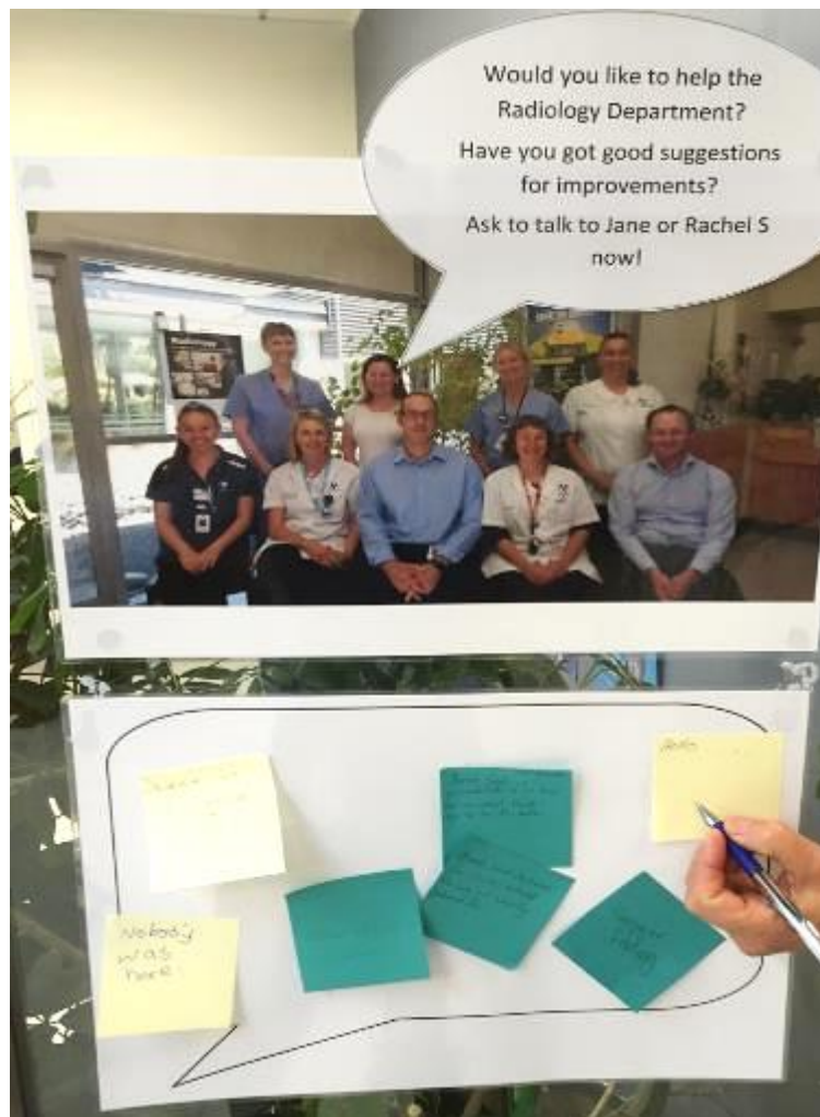
Post-it notes show emerging themes!