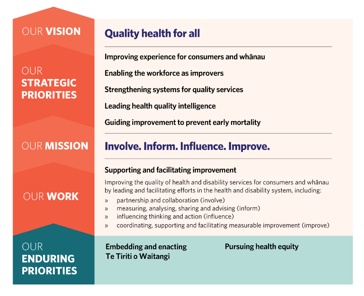
Figure 1: The strategic direction of Te Tāhū Hauora

The Pae Ora Act sets a clear direction for the health system to give effect to the principles of Te Tiriti o Waitangi, and work towards health equity for all.