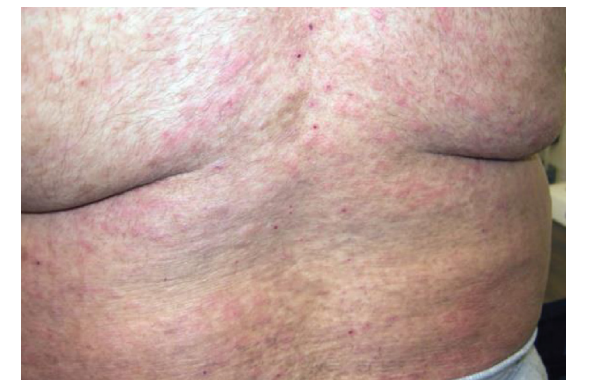
Polymorphous rash - papules, hive-like plaques, Extensive burrows in classical scabies (late scratch marks in classical scabies