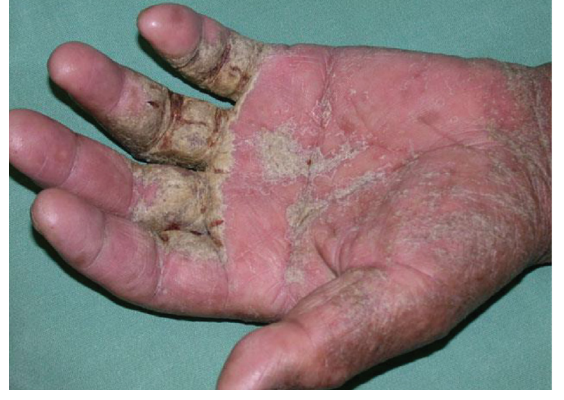
Numerous scaly burrows