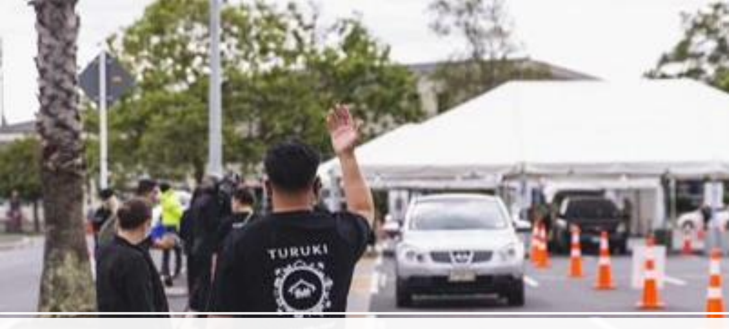
Covid 19-our greatest teacher...